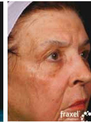
One month AFTER three Fraxel re:store treatments.