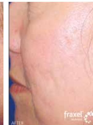
One month AFTER three Fraxel re:store treatments.