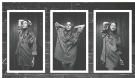
Sing Shabooh Shoobah SHIBUI In "Top Picks"